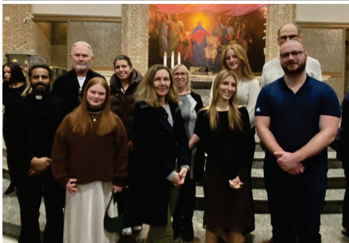
RCIA: Celebrating their Rites