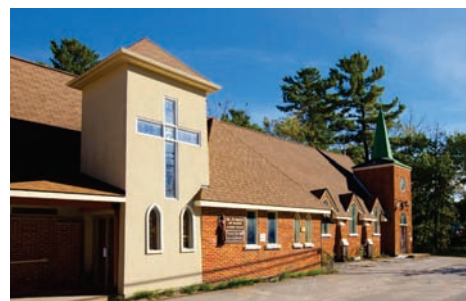
ST. FRANCIS - WASHAGO