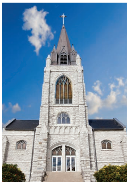
GUARDIAN ANGELS - ORILLIA