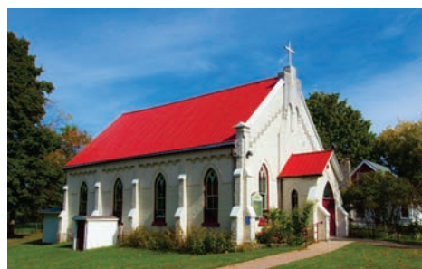
SACRED HEART - WARMINSTER