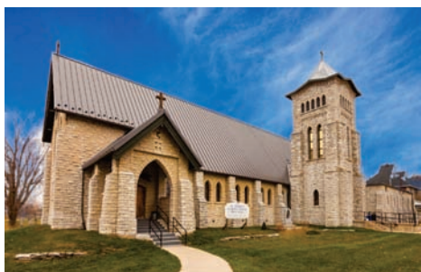
ST. ANDREW'S - BRECHIN