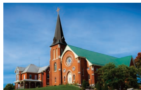
ST. COLUMBKILLE - UPTERGROVE