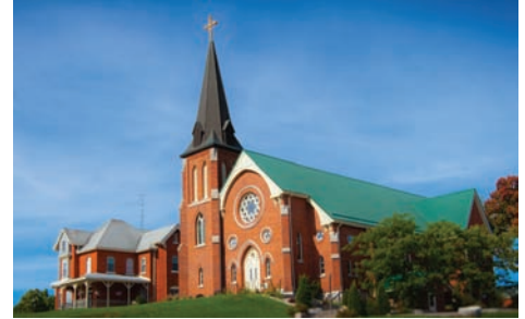
ST. COLUMBKILLE - UPTERGROVE