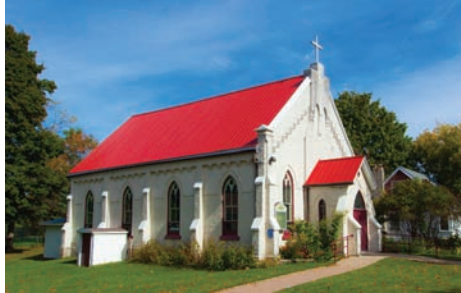
SACRED HEART - WARMINSTER