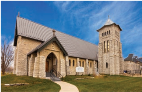
ST. ANDREW'S - BRECHIN